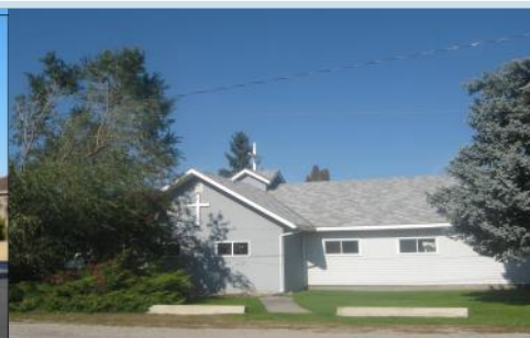
Saint Gregory's Osoyoos Indian Reserve In Inkameep