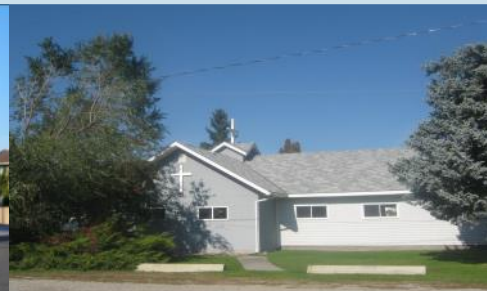
OUR LADY OF LOURDES MISSION 1039 Willow St. at 11th Ave. (St. Barbara's Anglican Church) Okanagan Falls, BC V0H 1R0