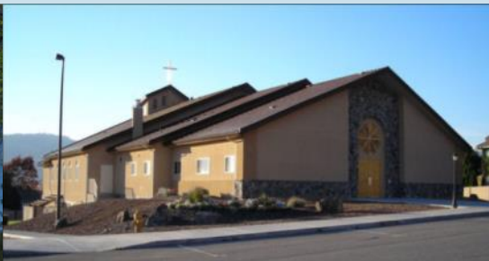
6044 Spartan St (P.O. Box 130) Oliver, BC, V0H 1T0, Canada