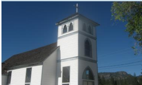
Saint Gregory's Osoyoos Indian Reserve In Inkameep

“If I speak in the tongues of mortals and of angels, but do not have love, I am a noisy gong or a clanging cymbal. Love is patient; love is kind; love is not envious or boastful or arrogant or rude. It does not insist on its own way; it is not irritable or resentful; it does not rejoice in wrongdoing, but rejoices in the truth” (1 Cor12. 1-4).