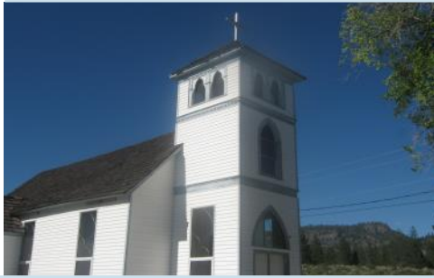
Saint Gregory's Osoyoos Indian Reserve In Inkameep