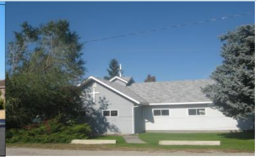
OUR LADY OF LOURDES MISSION 1039 Willow St. at 11th Ave. (St. Barbara's Anglican Church) Okanagan Falls, BC V0H 1R0