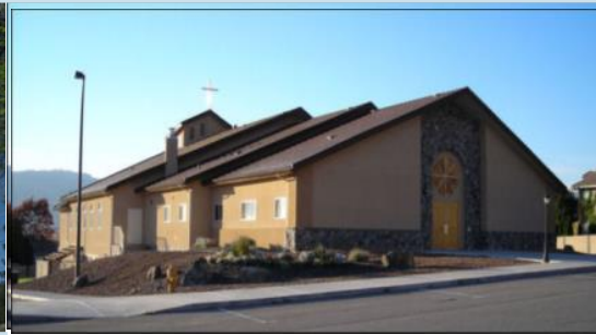
6044 Spartan St (P.O. Box 130) Oliver, BC, V0H 1T0, Canada