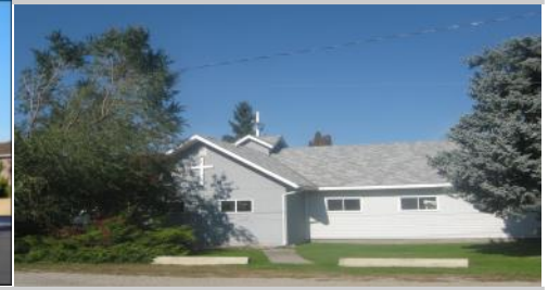
OUR LADY OF LOURDES MISSION

6044 Spartan St (P.O. Box 130) Oliver, BC, V0H 1T0, Canada